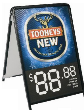
A-Frame with insert coreflute panels 600mm x 900mm

Approx. Weight 15kg (with 2 castor wheels)